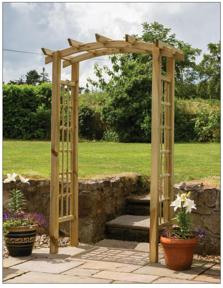
(W x D x H) 1.34m x 0.72m x 2.23m Product Name: Moonlight Arch

Pressure Treated products should not be treated with any other products for the first month.