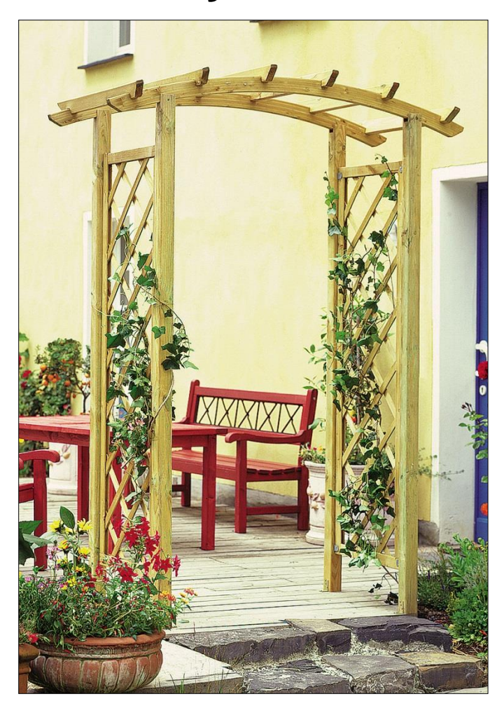
(W x D x H) 1.8m x 0.9m x 2.4m Product Name: Daria Arch

Pressure Treated products should not be treated with any other products for the first month.